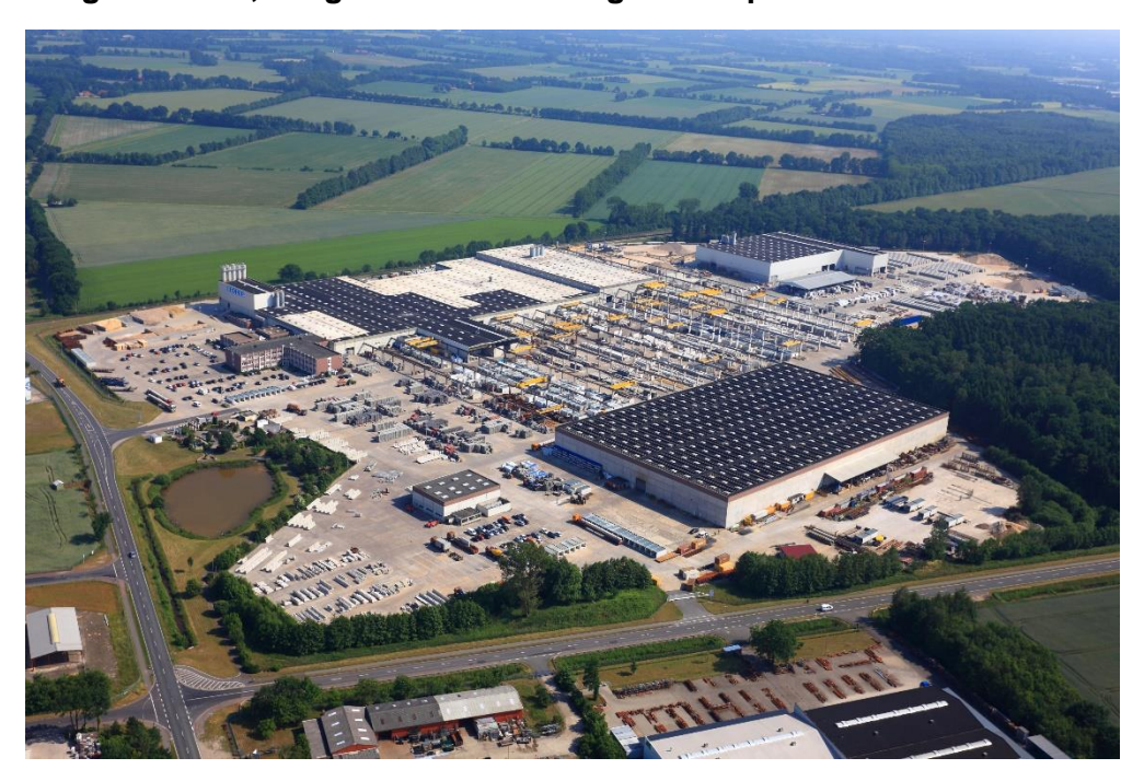
Aerial photograph of Rekers Betonwerk