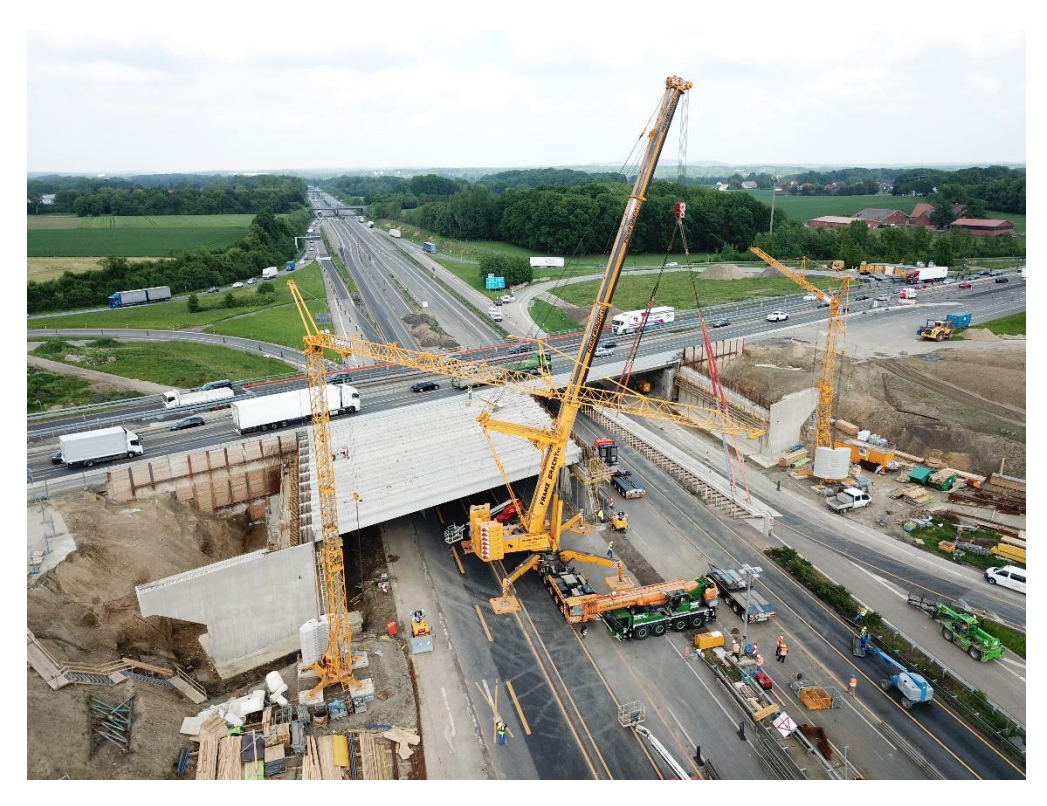
Construction of the temporary bridge at motorway junction Lotte/Osnabrück