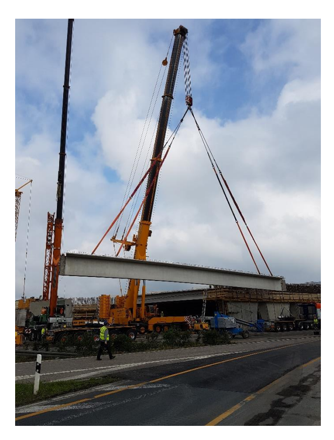
Prestressed concrete beams measuring 36 metres in length. The precast unit formwork was constructed using 24 alkus® AL 20 panels with a total surface area measuring over 200 square metres.