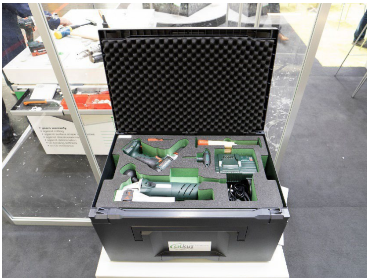
The new light version of the alkus ® repair kit was unveiled for the first time at bauma 2022