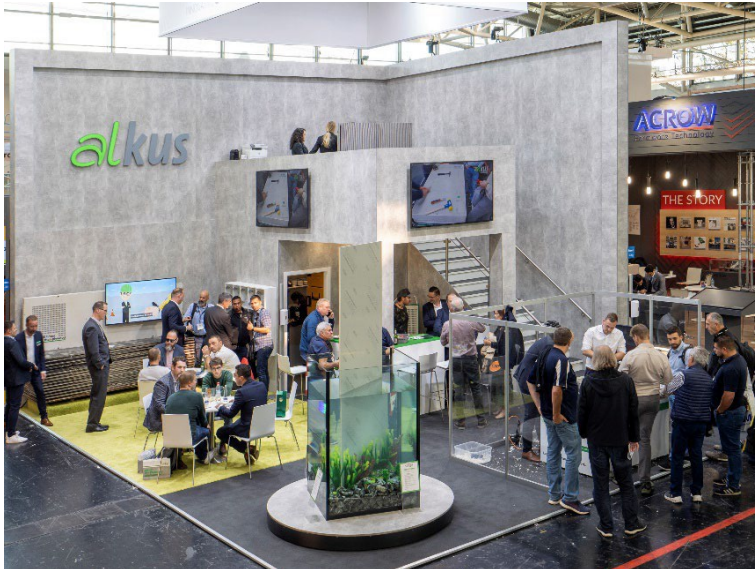
Various presentations of the solid plastic panel attracted many visitors to the alkus stand