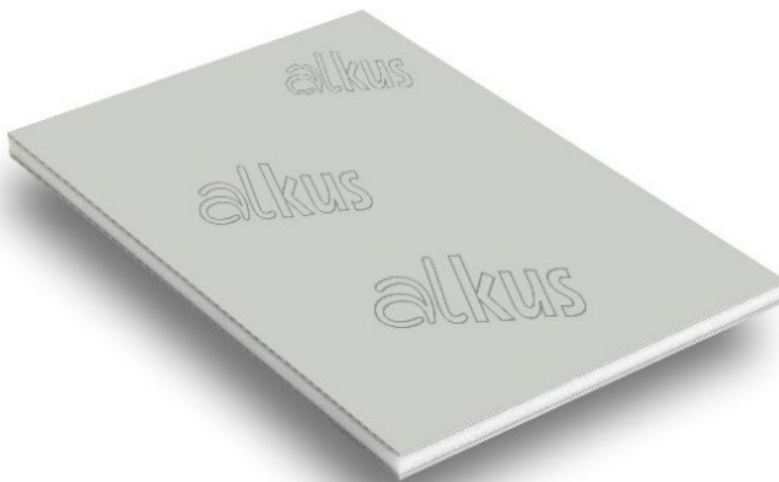
alkus ® formwork panels with new laser print.