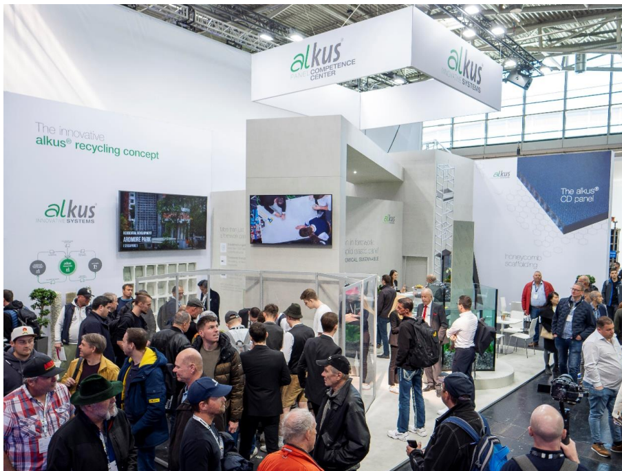
Exhibition stand of alkus AG at bauma 2025 with product demonstration.