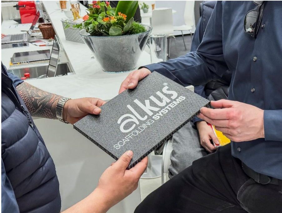
alkus Comfodeck panel: Scaffolding panel made of glass fiber reinforced polypropylene.