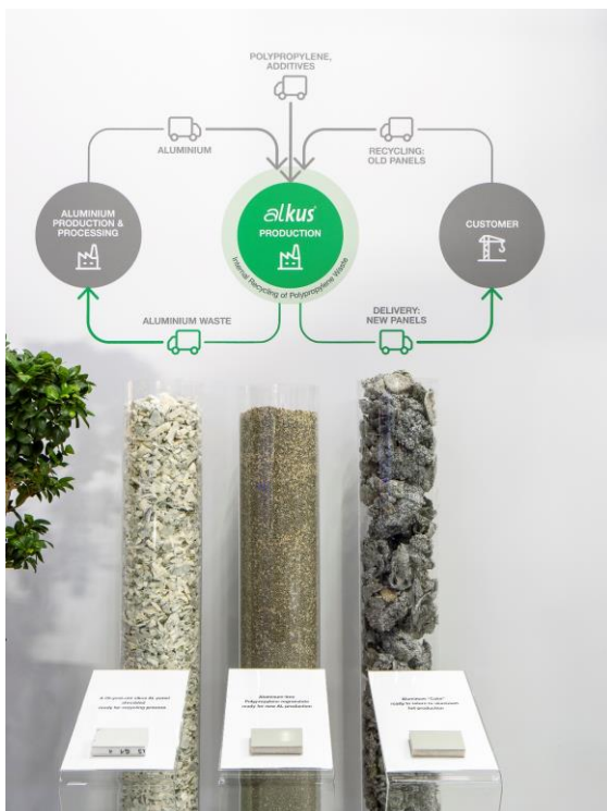
Presentation of the alkus AG recycling concept at bauma 2025